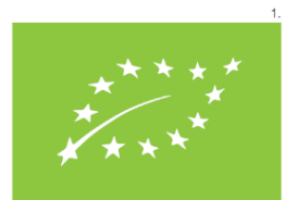
Pantone 376 | C050:M000:Y100:K000